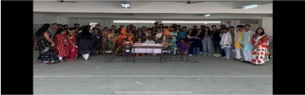
Students with teaching faculties

Brief report of programme (in 250 - 300 words)